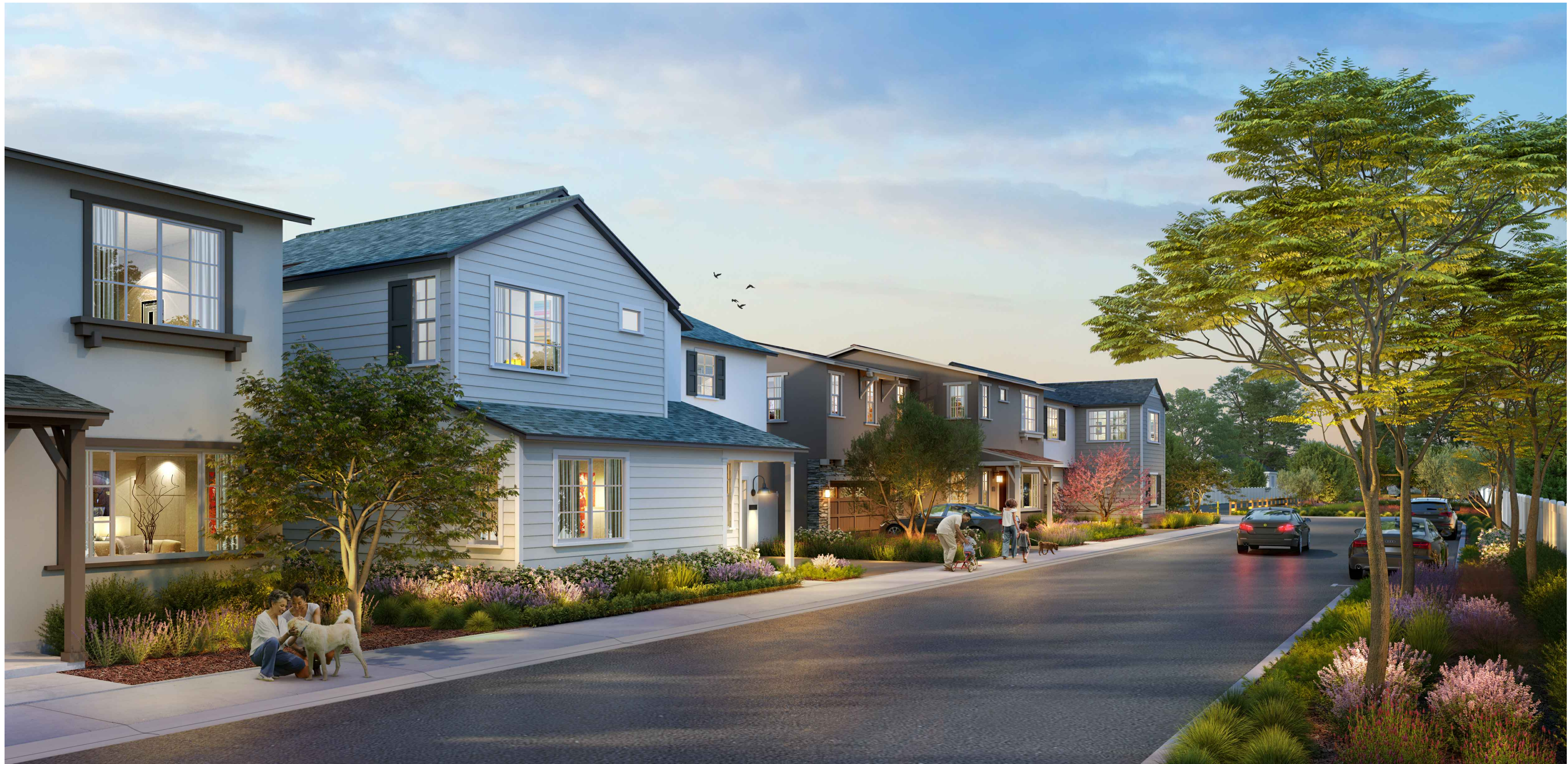
VIEW LOOKING SOUTH TOWARDS PARK